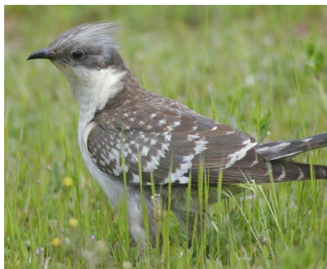
GREAT SPOTTED CUCKOO

Among the bird species normally found in the montado are kestrels, little owls, southern grey shrikes, black-winged kites, Iberian imperial eagles, black vultures, great spotted cuckoos and black storks, of which there are only 83 - 96 pairs in Portugal (Source: ICBN).